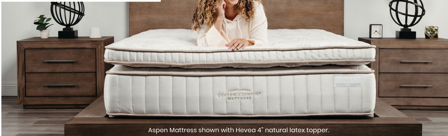
Aspen Mattress shown with Hevea 4" natural latex topper.