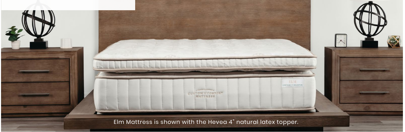
Elm Mattress is shown with the Hevea 4" natural latex topper.