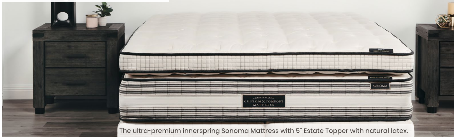
The ultra-premium innerspring Sonoma Mattress with 5" Estate Topper with natural latex.