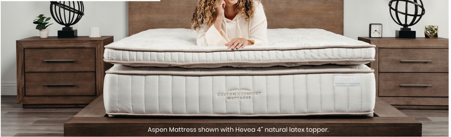
Aspen Mattress shown with Hevea 4" natural latex topper.