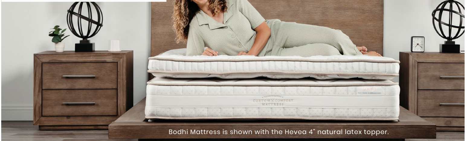
Bodhi Mattress is shown with the Hevea 4" natural latex topper.