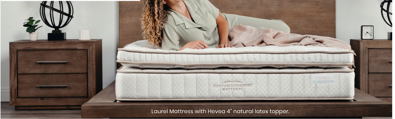
Laurel Mattress with Hevea 4" natural latex topper.