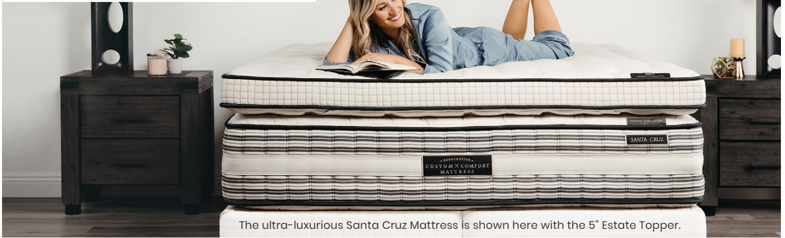
The ultra-luxurious Santa Cruz Mattress is shown here with the 5" Estate Topper.