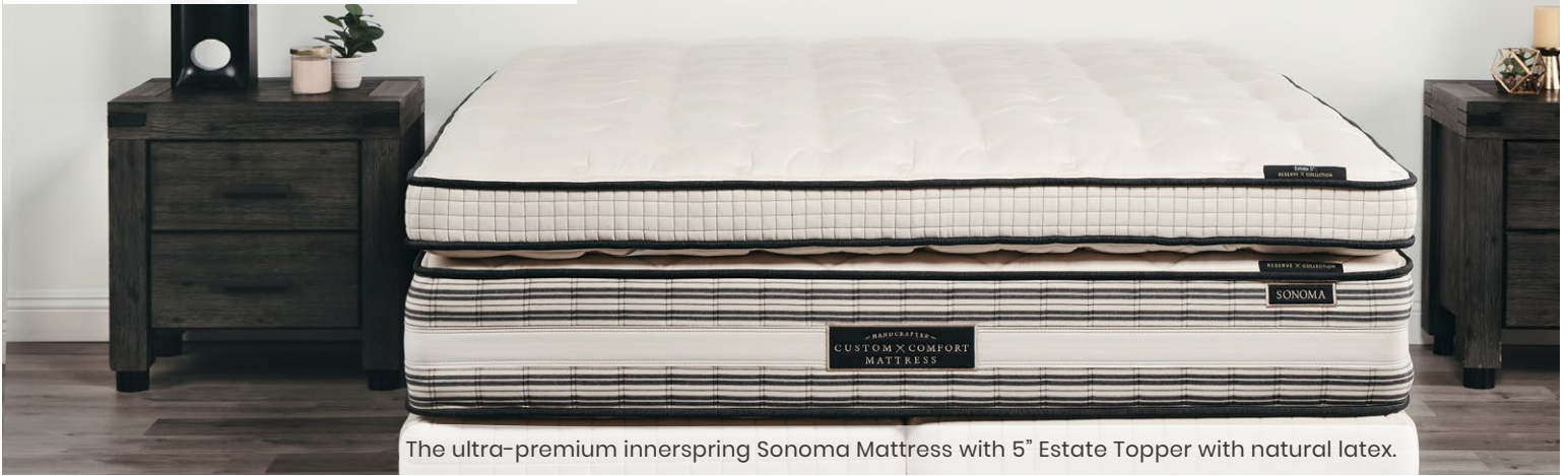
The ultra-premium innerspring Sonoma Mattress with 5" Estate Topper with natural latex.