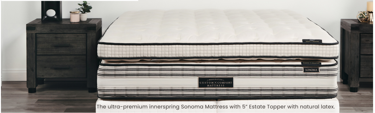
The ultra-premium innerspring Sonoma Mattress with 5" Estate Topper with natural latex.